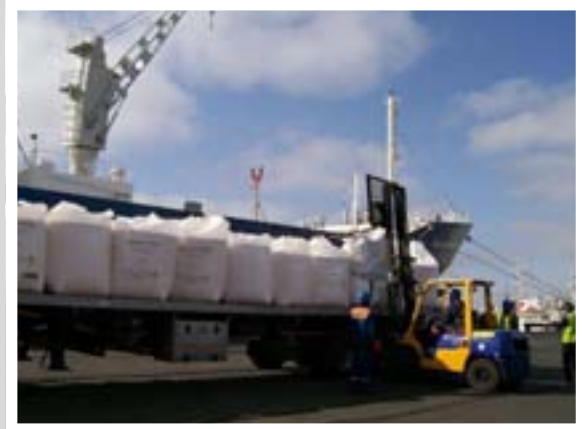
Ammonium Nitrate being loaded onto the Baltic Navigator vessel

In light of the above, it is clear that the Walvis Bay Corridors via the Port of Walvis Bay has been increasingly become the alternative trade route for all imports and exports and at the same time proving to be efficient and reliable.