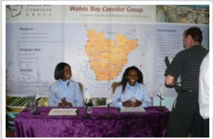
Registration at the WBCG “border”