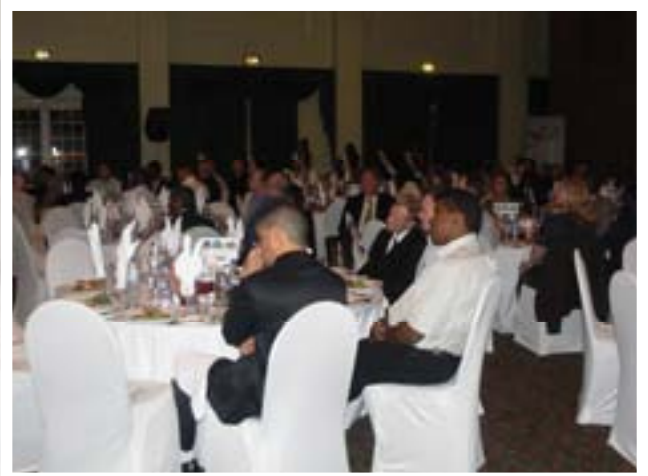
Guests listening attentively to the various benefits that the WBCG has to offer

transport along the Trans Kalahari Corridor. Amongst them being SAD 500, adoption of common transit procedures, extension of border operating hours and harmonization of axle load limits.