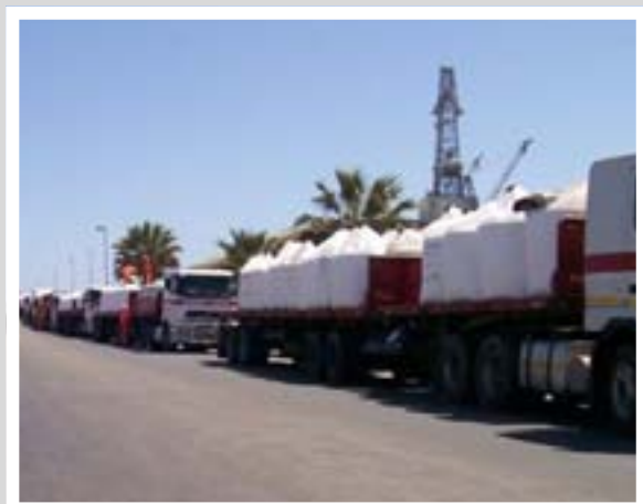
Trucks en route destined for Zambia along the Trans Caprivi Corridor