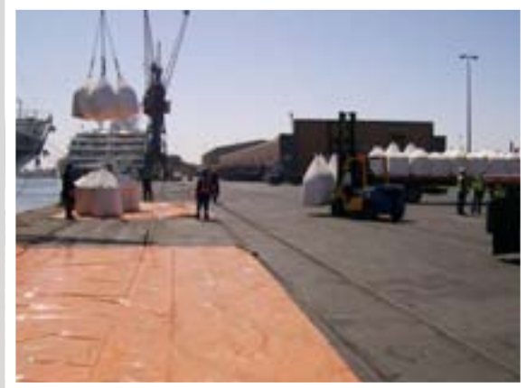
Ammonium Nitrate being off loaded onto the trucks at the Port of Walvis Bay