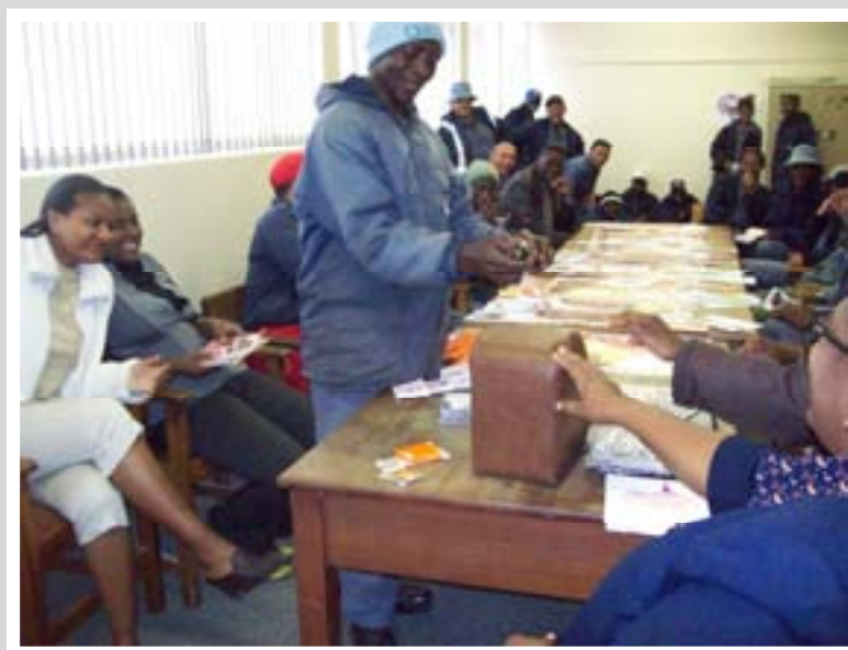
Employees receiving education on the correct usage of condoms

This remarkable initiative was well received by all the other involved stakeholders including the Erongo District AIDS Committee. The Support Group and the Help Desk would like to express its profound appreciation to the following companies and institutions for their unwavering support in making this campaign a remarkable success: Transworld Cargo, Unitrans, F.P. du Toit Transport, Wesbank Transport, Rennies Consolidate, Ministry of Finance, Walcon Construction, Namport, Manica, Social Security Commission, TransNamib Holdings, Jowells Transport and the District AIDS Committee.