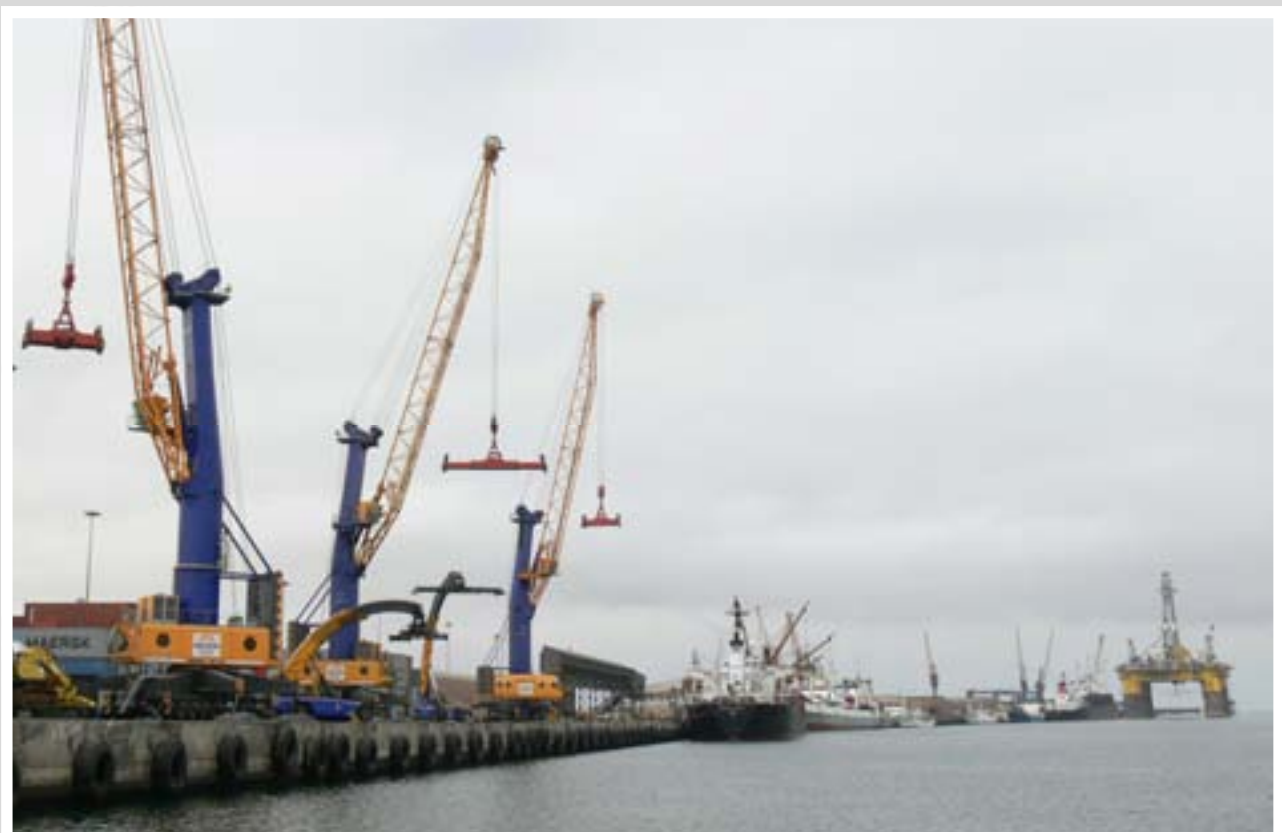
Mobile Harbour Cranes at the Port of Walvis Bay

It is apparent that the confidence in utilizing the Walvis Bay Corridors via the Port of Walvis Bay has increased which has resulted in the Port investing in adding capacity and improving efficiency to meet the