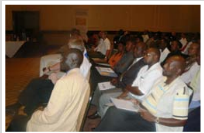
Guests listening attentively to the presentations